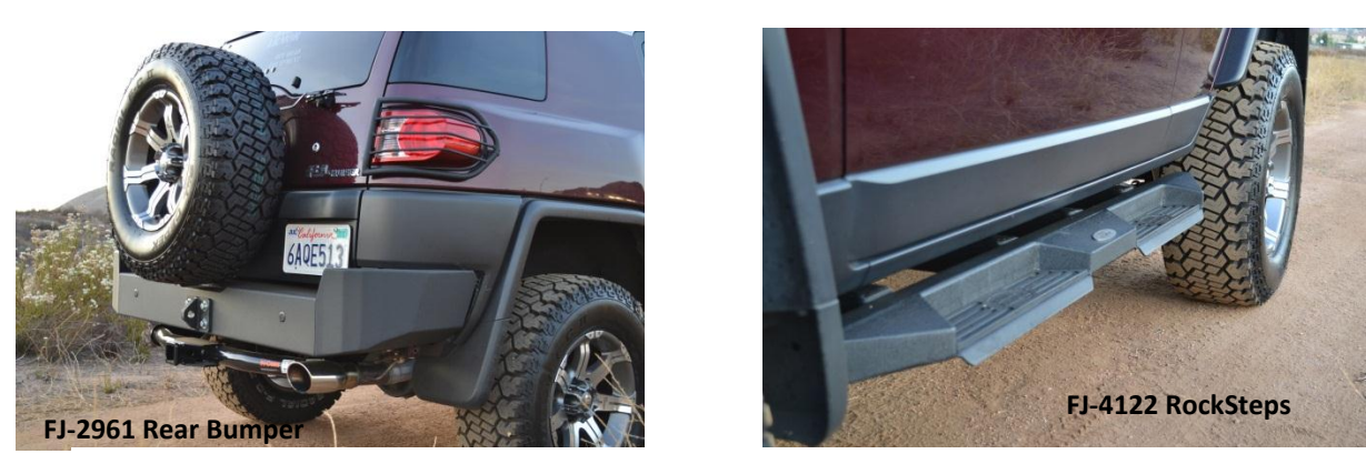
Other Body Armor products for the FJ Cruiser