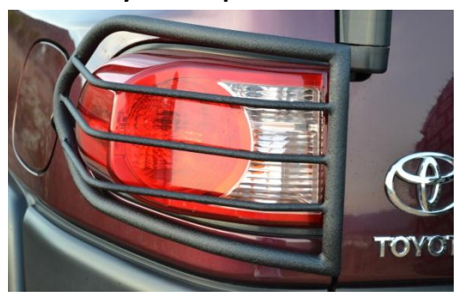
FJ-7135 Taillight guards